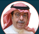
Sultan Al Bazie CEO of The Theater and Performing Arts Commission